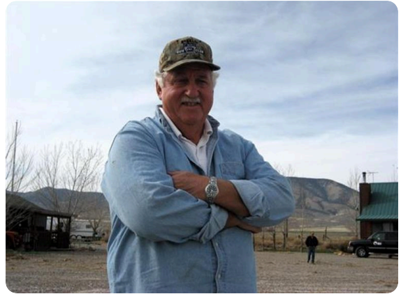
Gunnison Hunting Club