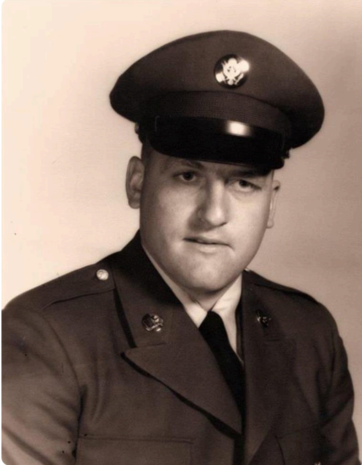
United States Army