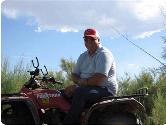
Gunnison Hunting Club